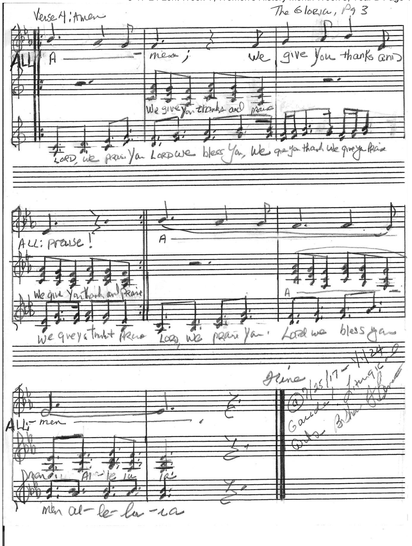
3-17-24 Lent Week V, Women's History Month Week 3, Year B Page 14 of 42